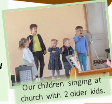
Our children singing at church with 2 older kids.