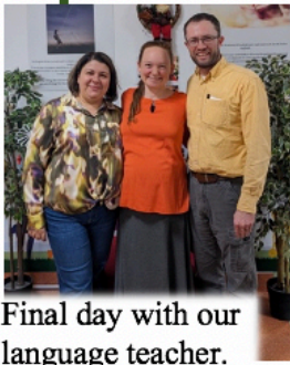
Final day with our language teacher.